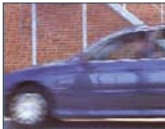
Interlaced, 20 ms difference between odd and even lines