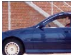
Progressive Scan, all lines are captured at the same time

Progressive scan is used instead of the interlaced method found in analog CCTV (PAL/NTSC) cameras. With progressive scan all pixels (lines) are captured at the same time, enabling moving images to be presented without distortion.